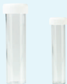
3010 17ml 3012 5ml