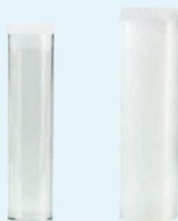
4613 17ml 4586/7 25ml