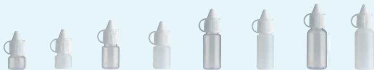
Metric 2.5ml Jubilee 2.5ml Metric 5ml Jubilee 5ml Metric 10ml Jubilee 10ml Metric 15ml Jubilee 15ml