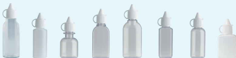
Opal 30ml Jubilee 25ml Regency 25ml Wyvern 25ml Griffin 25ml Classic 25ml Metric 25ml Rectangular 20ml