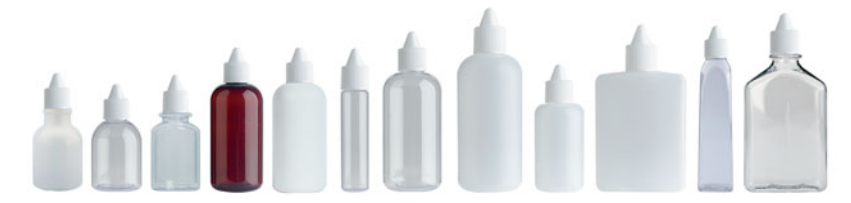
Topaz Dumpy Crown Amber Platinum Tube PETG Poly Cylindrical Rectangular Nature Charnwood