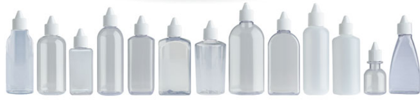
Opal Metric Bradgate Europa Classic Quadra Swithland Griffin Wyvern Martlet Jubilee Regency Pageant